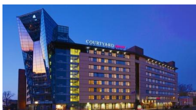
Courtyard Marriott City Center

Organizing Committee recommends the following hotels for accommodation: